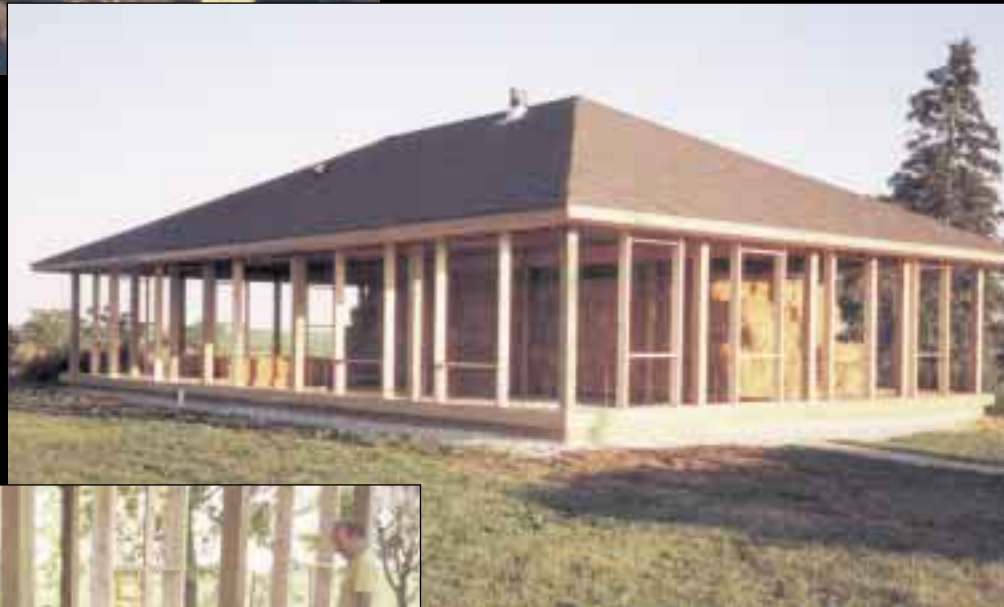
The framing finished. Simple 2 by 6 frames were built for doors and windows.