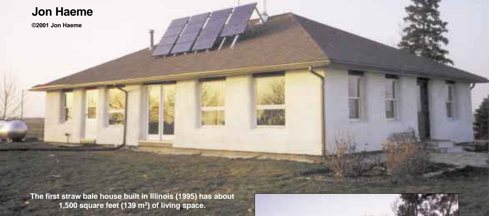
The first straw bale house built in Illinois (1995) has about 1,500 square feet (139 m 2 ) of living space.

W e had been renting an old farmhouse, freezing our butts off every winter, when an opportunity to buy a five acre farmstead came our way. It had an old rundown house, which we considered fixing up. But as we tore into it, we realized that we would have to spend a lot of money, and still wouldn't have a very energy-efficient house.