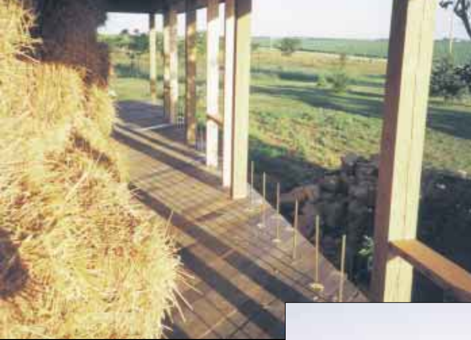
The floor joists were drilled, and rebar was inserted to impale the first course of straw.