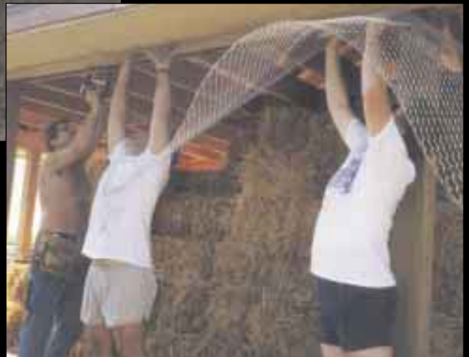
Chicken wire was tacked up, and later pulled over the straw.