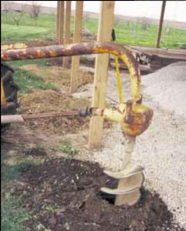
Post auger digging post holes.

Post and beam frame. Built like a pole barn, 6 by 6 treated posts are buried 4 feet (1.2 m) deep on concrete footings and backfilled with gravel.