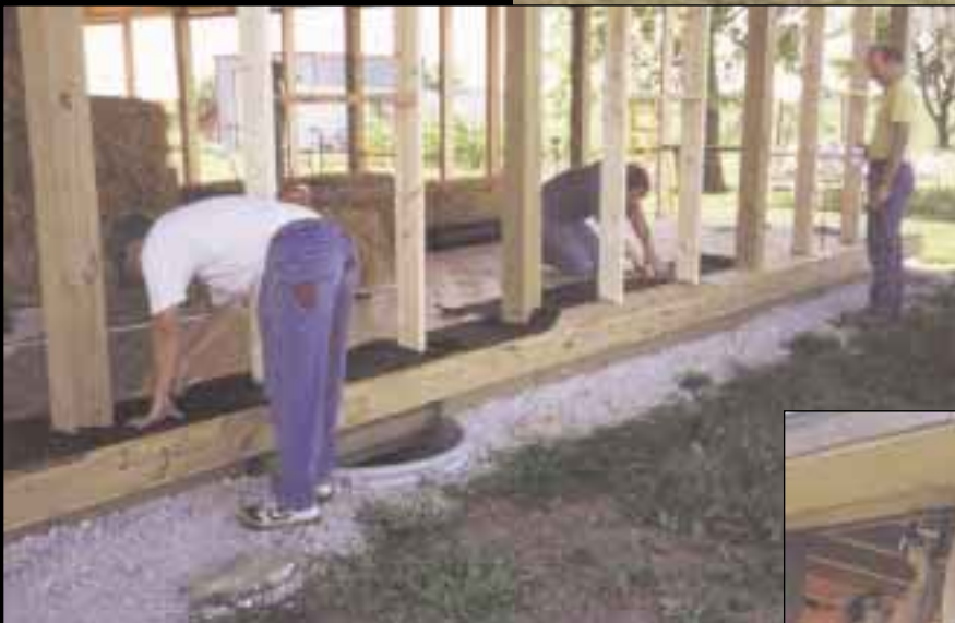
Tar paper was put under the straw as a vapor barrier.